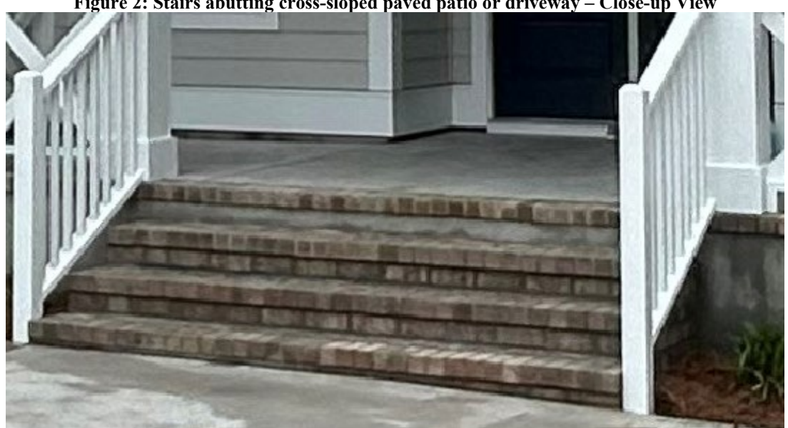
Figure 2: Stairs abutting cross-sloped paved patio or driveway – Close-up View