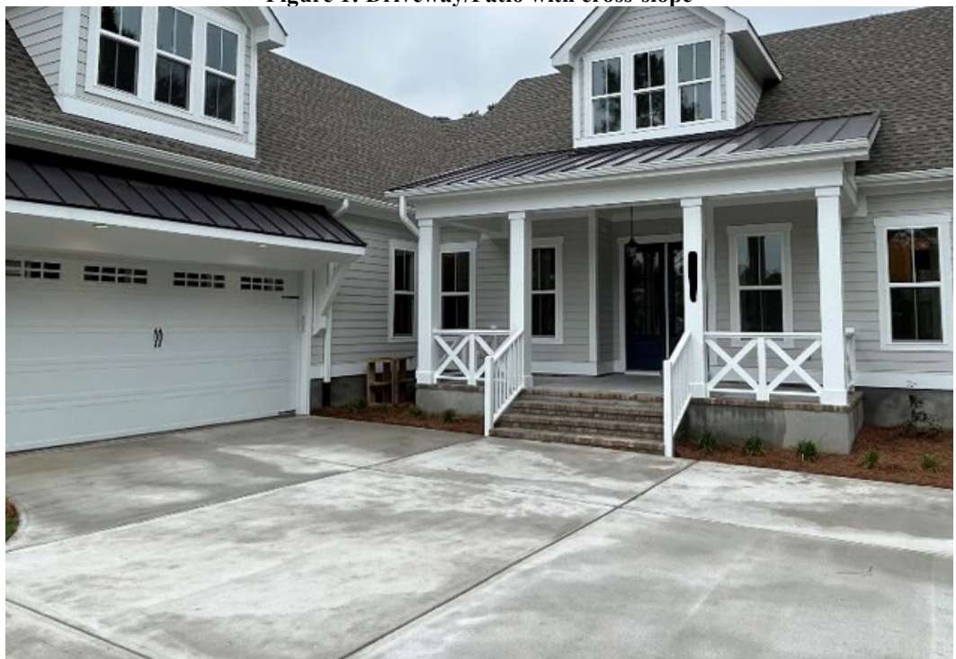
Figure 1: Driveway/Patio with cross-slope

A slope may also be a compound slope, i.e. both a cross-slope and a slope in the direction of travel. See Figure 3 for illustration of a cross-slope. For simplicity, the slope in the direction of travel is not shown.