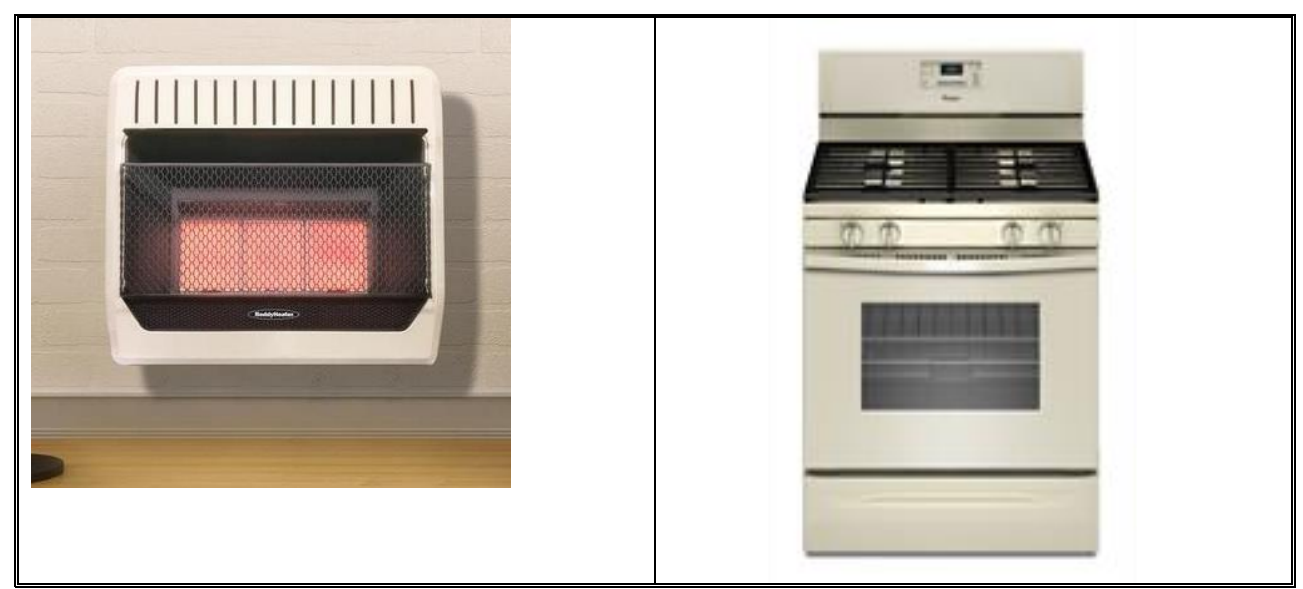
Figure 3: Listed Unvented Room Heater and Domestic Gas Range

An unvented fuel-burning appliance is one that is, of course, not required to be vented by the manufacturer or minimum code. See NC Fuel Gas Code Section 501.8<sup>iv</sup>. An example of this would be a listed domestic gas range or a listed unvented gas room heater. Therefore, in determining whether or not the Exception to 505.2 can be used, a fuel-fired domestic range in and of itself would not disallow the Exception to 505.2. See Figure 3 for examples.