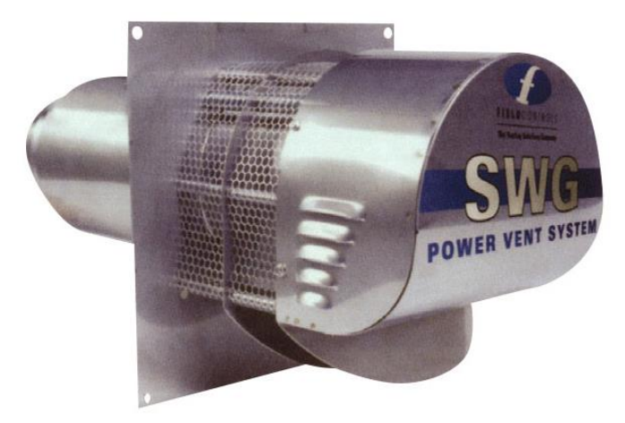
Figure 2: Diagram of Direct Vent for a Power Vented Appliance (appliance not shown)