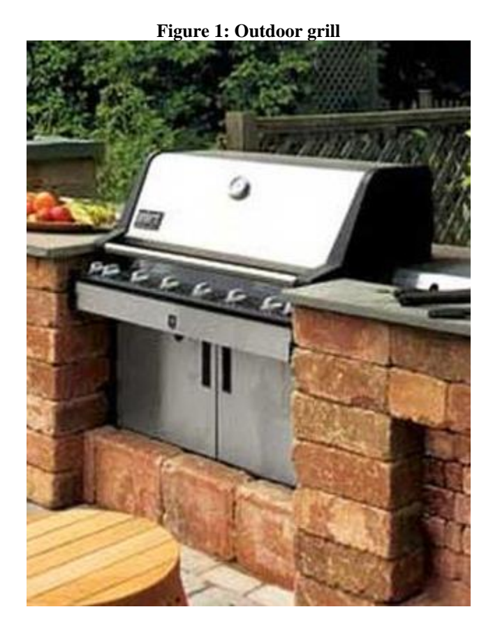
Page 3 of 5

In many cases, the building owner may intend to use grilles that are not permanent or pulled on trailers. There is no intent by this interpretation to limit those, but the building code official would not be the party responsible for inspecting said grille for the requirements of DHHS.