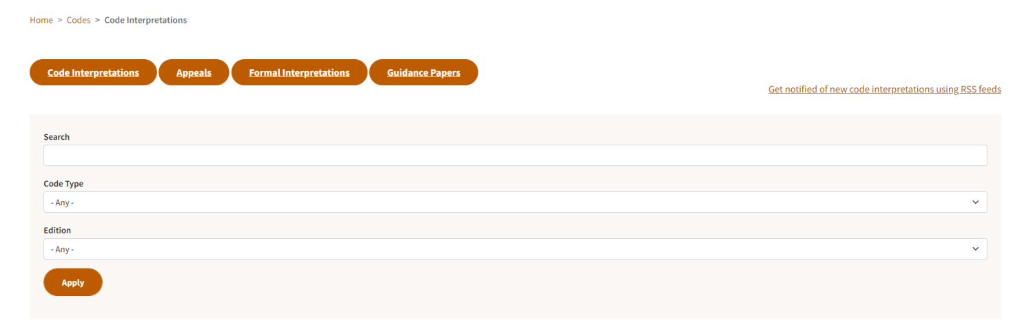
FIGURE 1: NEW LOOK OF CODE INTERPRETATIONS LANDING PAGE