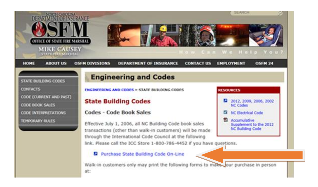
FIGURE 1: OSFM ON-LINE CODE SALES LINK