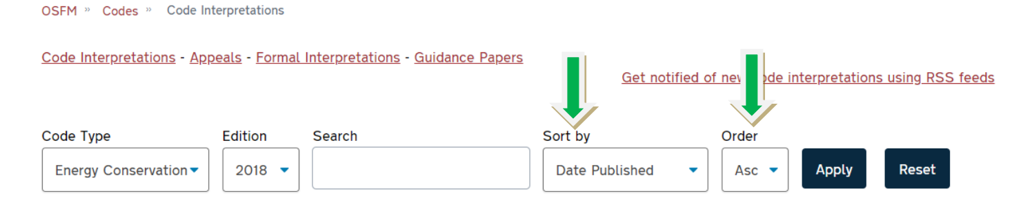
FIGURE 4: NEW LOOK OF CODE INTERPRETATIONS LANDING PAGE